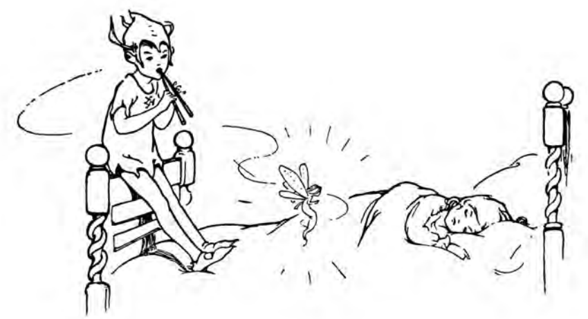
PETER SOMETIMES CAME AND PLAYED ON HIS PIPES.

"What nonsense you talk, precious. No one can get into the house without knocking."